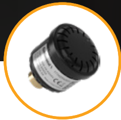
Valve Cap Sensor

Fastest installation of any tire sensor.