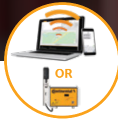
ContiConnect LIVE or ContiConnect Yard