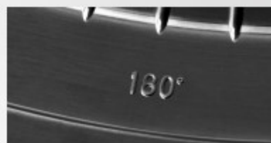
Angle Indicator (0° - 90° - 180° - 270°)