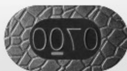
Made in Germany (Underscore 3rd position)