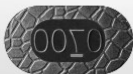
Made in Mexico (Underscore 2nd position)