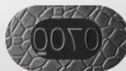
Made in Malaysia (Underscore 4th position)