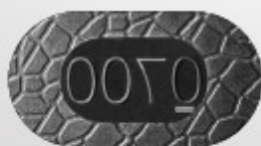
Made in Czech Republic (Underscore 1st position)