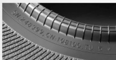
SN: Serial Number of Bladder Mold CN: Contour Number