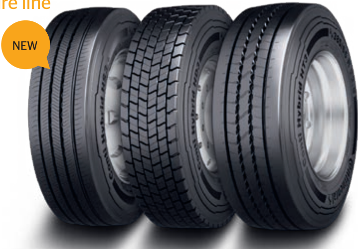
Conti Hybrid HS3+ Conti Hybrid HD3 Conti Hybrid HT33