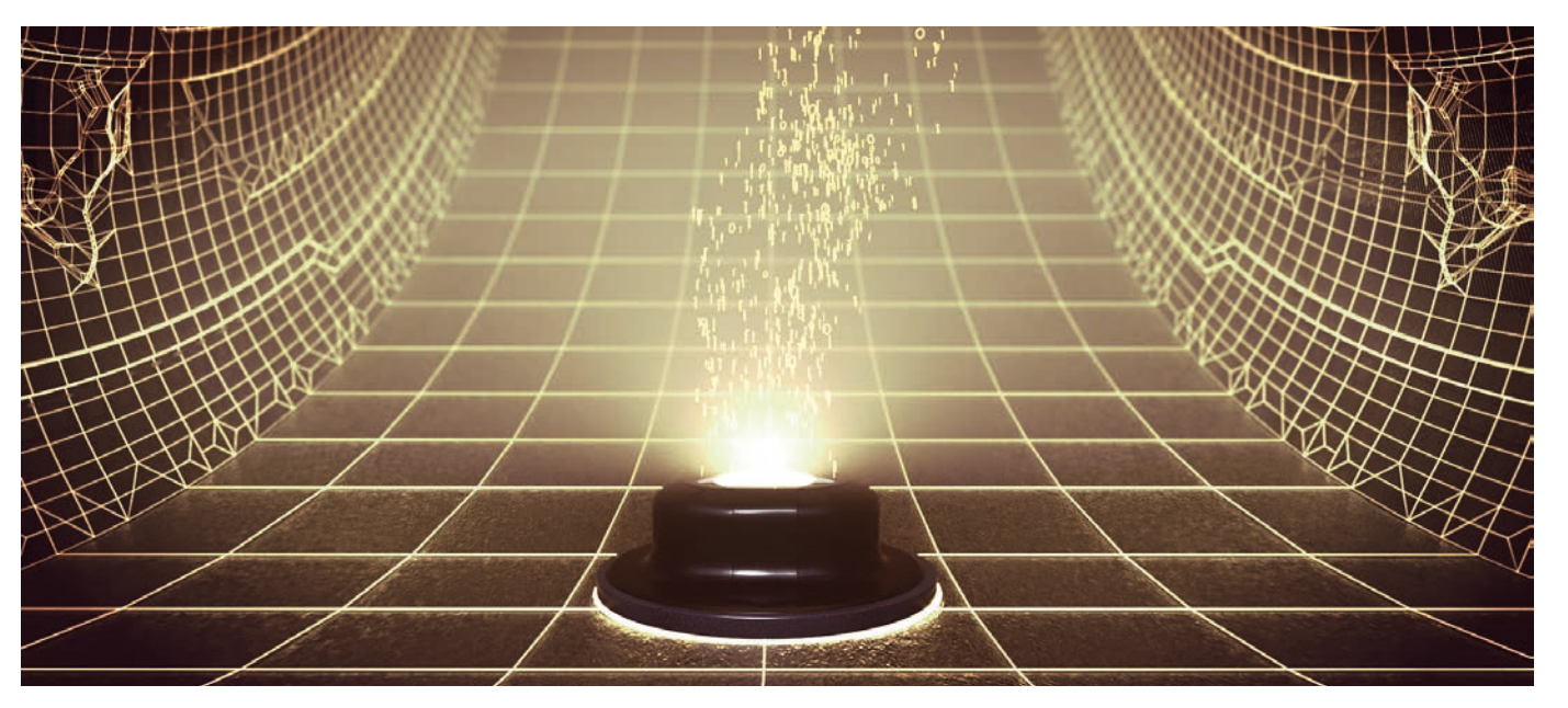
Continental tyre sensors are at the core of both ContiPressureCheck<sup>™</sup> and ContiConnect<sup>™</sup>, Continental's digital tyre-monitoring systems. The intelligent sensors constantly measure temperature and air pressure from inside the tyre and provide data to be displayed on your dashboard - whether this is inside the driver's cabin or on a Web portal overseeing the fleet.