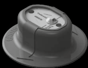
Sensor in housing

ContiPressureCheck™ is a pressure monitoring system mounted inside the tyre to help extend the life of your tyres. Properly inflated tyres wear better, retain their casing quality and save on fuel consumption. When inflation pressure drops, the tyre is subjected to greater rolling strain and as a result may heat up. This can damage the tyre, or even lead to a blow-out. ContiPressureCheck™ can prevent this, and thereby helps protect your investment.