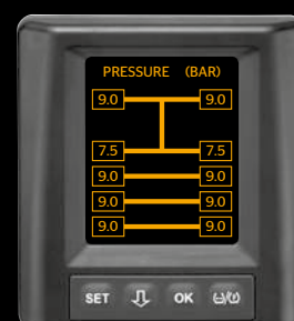
Display in the cockpit