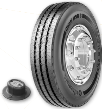
1 Tire Sensor (One per running wheel)