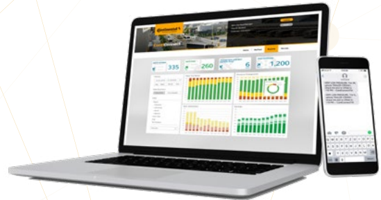
3 Web Portal & Mobile Alerts