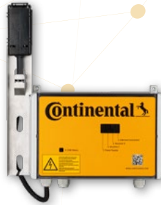
2 Yard Reader