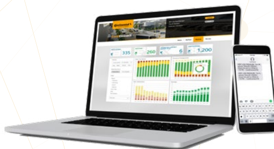
3 Web Portal & Mobile Alerts