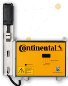
2 Yard Reader