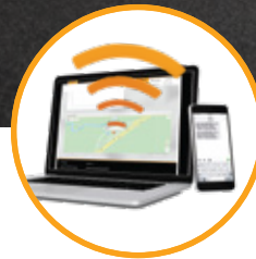
ContiConnect™ LIVE Portal/App Connection