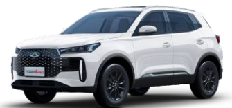
Chery Tiggo 4 Pro