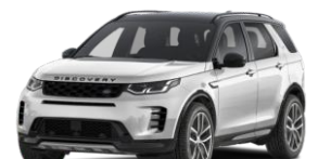
Land Rover Discovery